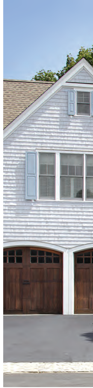
Swathed in soft linen, the guest bed (left) appears to guarantee a restful night's sleep. This beachy guest room is as polished and commodious as any master suite. The façade of the house (above) was stained dark, with green shutters, before Marhsall lightened it up with a Nantucket-style makeover.